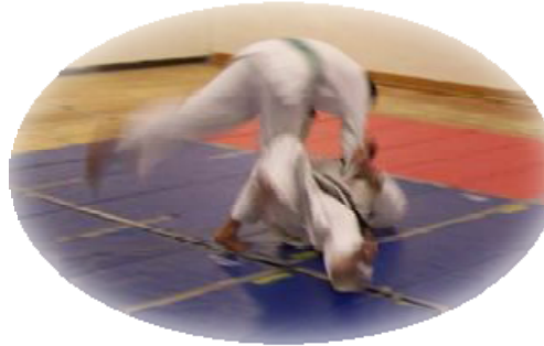
Bentley-sensei demonstrating yoko wakare.

Judo is best known for its spectacular throwing techniques but also involves considerable grappling on the ground utilizing specialized pins, control holds, arm locks, and Judo choking techniques. Judo emphasizes safety, and full physical activity for top conditioning. Judo is learned on special mats for comfort and safety.